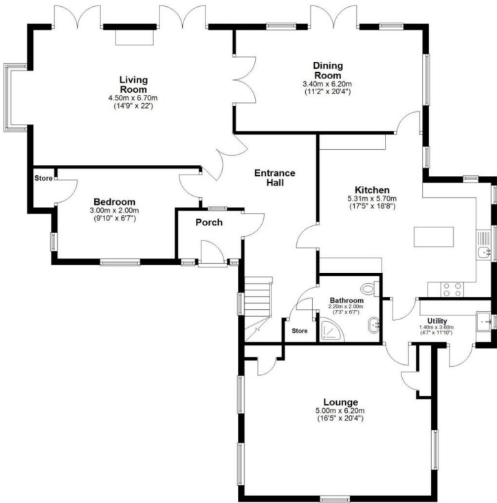
Ground Floor Approx. 157.9 sq. metres (1699.2 sq. feet)