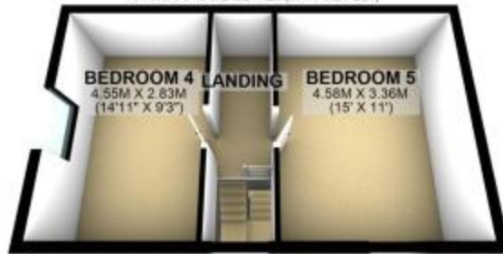
SECOND FLOOR APPROX. 34.5 SQ. METRES (371.4 SQ. FEET)