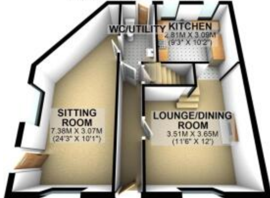
GROUND FLOOR APPROX. 53.4 SQ. METRES (574.9 SQ. FEET)