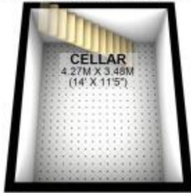
BASEMENT APPROX. 14.9 SQ. METRES (159.9 SQ. FEET)