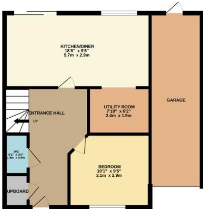
GROUND FLOOR 612 sq.ft. (56.9 sq.m.) approx.