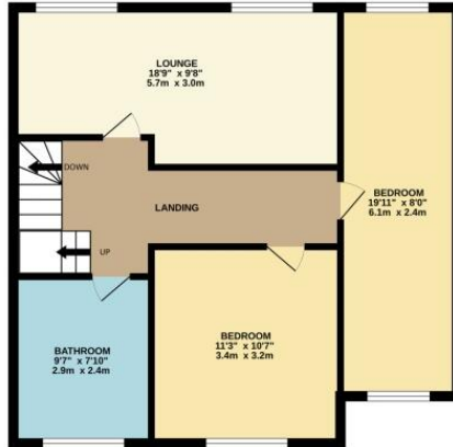
1ST FLOOR 612 sq.ft. (56.9 sq.m.) approx.