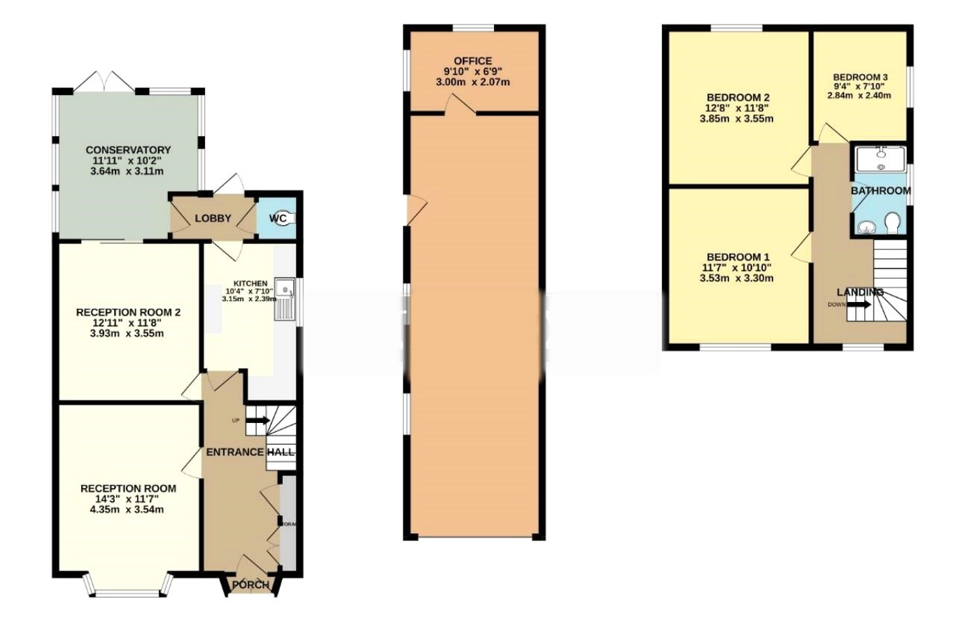
TOTAL FLOOR AREA: 1637 sq.ft. (152.0 sq.m.) approx.

GROUND FLOOR 1ST FLOOR 1140 sq.ft. (105.9 sq.m.) approx. 497 sq.ft. (46.2 sq.m.) approx.