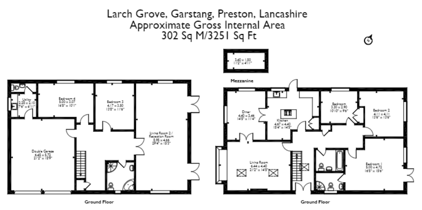
Please note that the location of doors, windows and other items are approximate and this floorplan is to be used for illustrative purposes only. Unauthorized reproduction is prohibited.