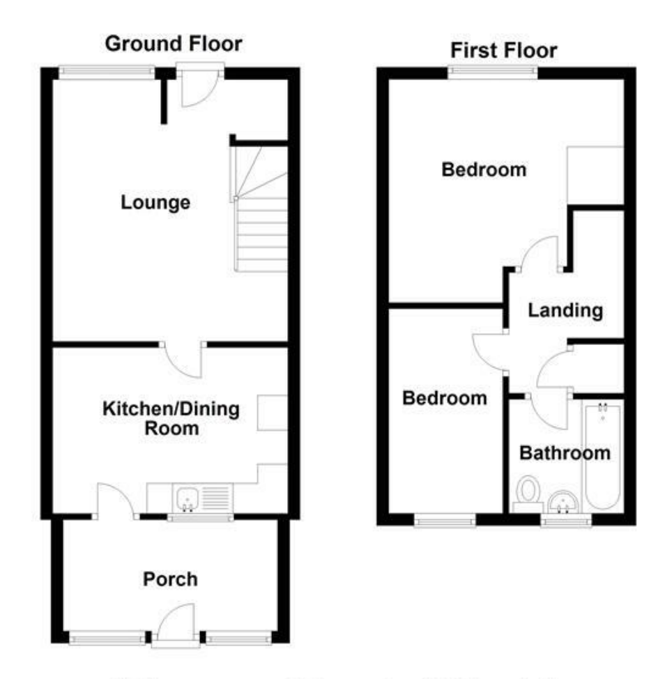
Total area: approx. 62.9 sq. metres (676.7 sq. feet)