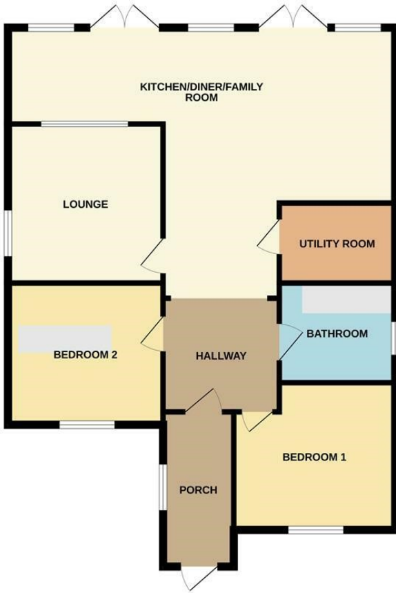
1ST FLOOR 409 sq.ft. (38.0 sq.m.) approx.